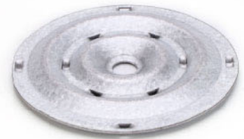
Part No. :SHBP-0860

membrane fasteners must penetrate steel decks a minimum of 19 mm (3/4" ). Using a screw gun, drive the fastener until a slight depression is seen around the plate, or with very rigid boards, watch for the plate to dimple. Note: Care must be taken not to overdrive the fastener and fracture the skin of the insulation. The fastener must be tight enough so that the plate does not turn. Factory Mutual requires that the fastener penetrate the steel deck at the top flute.