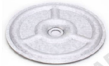
Part No. :SHIP-0672

Thickness: 0.0236" (0.6mm) Diameter: 2.83" (72mm) Hole Diameter: 0.275" (7mm) Coating: Galvalume AZ55