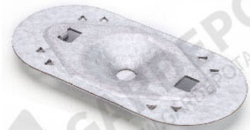
Part No. :SHBP-1081

Thickness: 0.0315" (0.8mm) Diameter: 2.36" (60mm) Hole Diameter: 0.264" (6.7mm) Coating: Galvalume AZ55