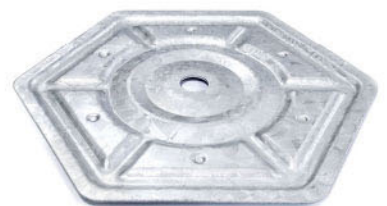
Part No. :SHIP-0683

Thickness: 0.0394" (1mm) Length: 3.19" (81mm) Breadth: 1.57" (40mm) Hole Diameter: 0.236" (6mm) Coating: Galvalume AZ55