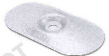
Part No. :SHIP-1081

Thickness: 0.0236" (0.6mm) Diameter: 3" (76.2mm) Hole Diameter: 0.264" (6.7mm) Coating: Galvalume AZ55