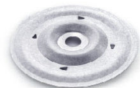
Part No. :SHBP-0850S

Thickness: 0.0394" (1mm) Length: 3.19" (81mm) Breadth :1.57" (40mm) Hole Diameter: 0.236" (6mm) Coating: Galvalume AZ55