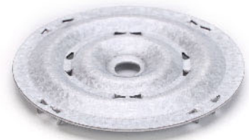
Part No. :SHBP-0860S

Thickness: 0.0315" (0.8mm) Diameter: 2.36" (60mm) Hole Diameter: 0.264" (6.7mm) Coating: Galvalume AZ55